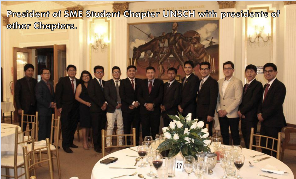
President of SME Student Chapter UNSCH with presidents of other Chapters.