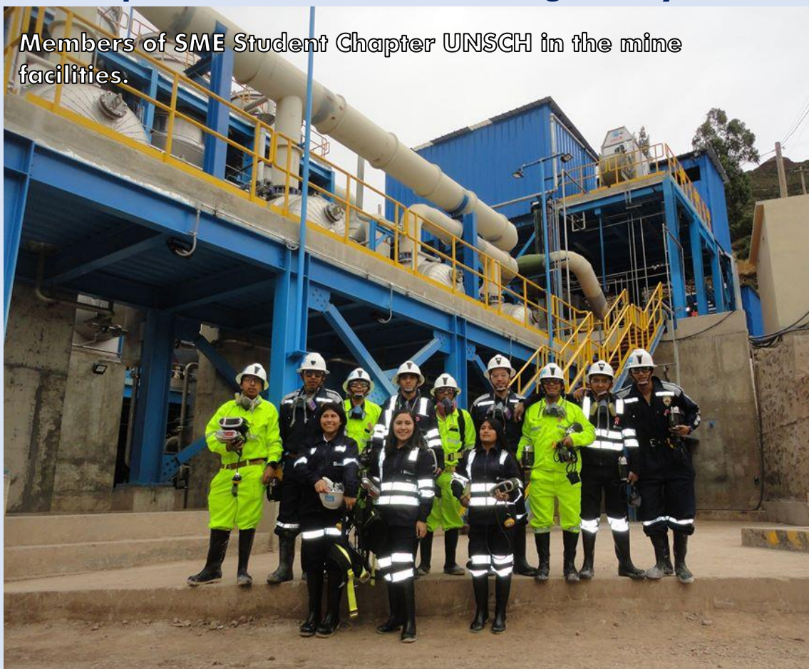
Members of SME Student Chapter UNSCH in the mine facilities.