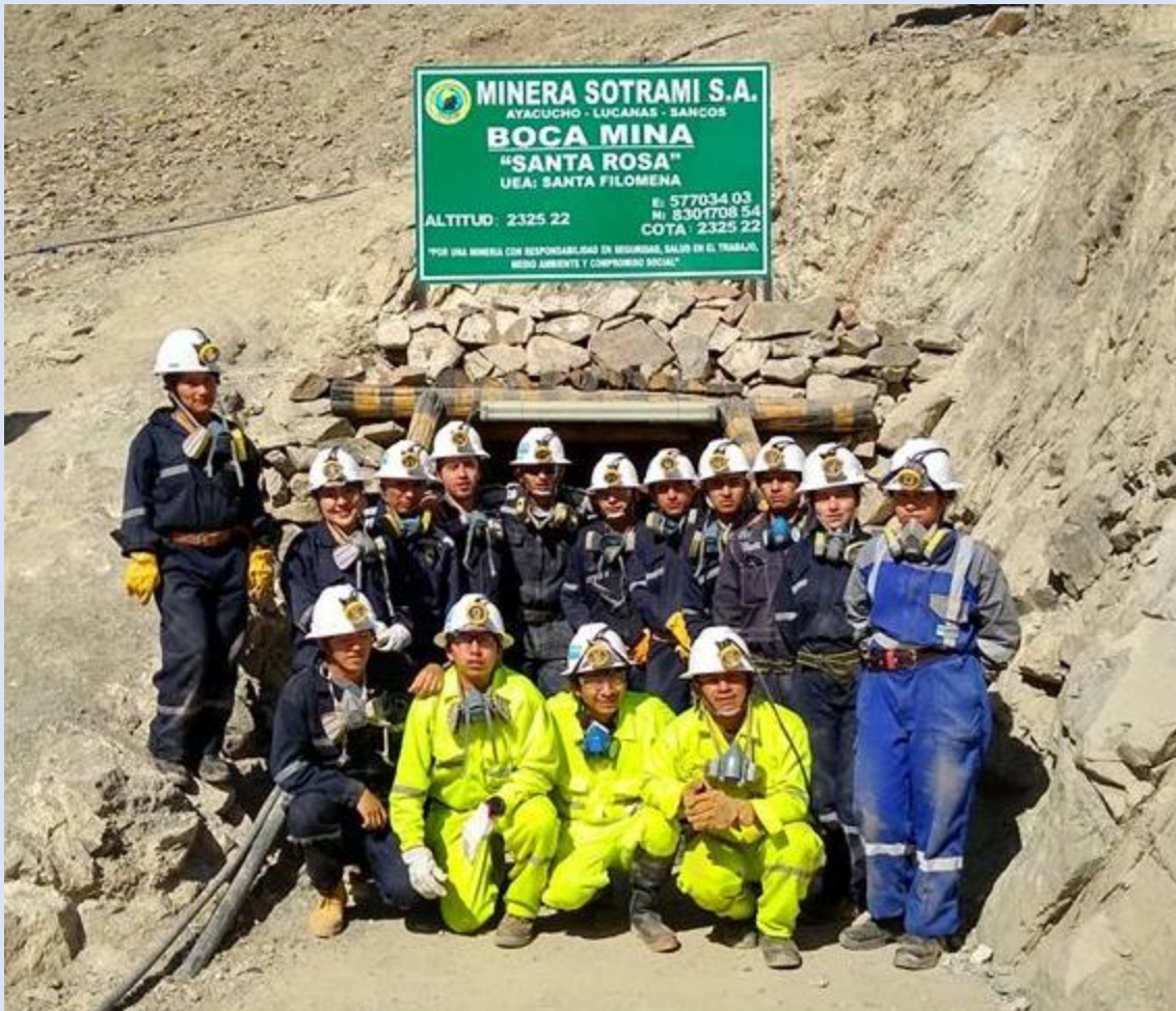
Members of SME Student Chapter UNSCH in the mine entrance.