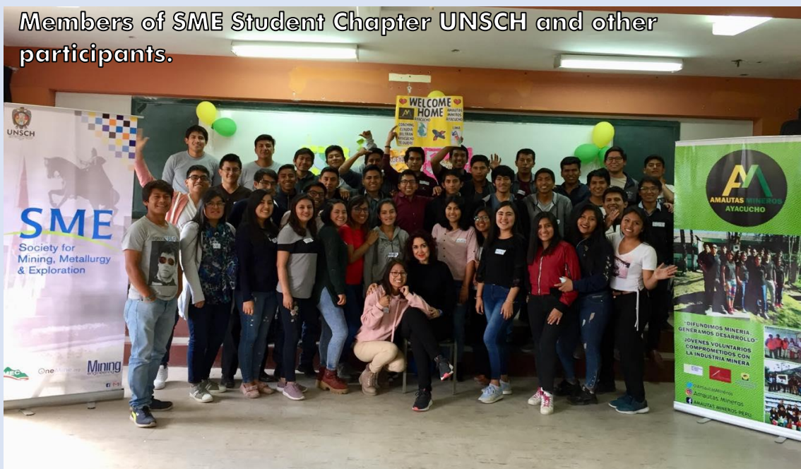
Members of SME Student Chapter UNSCH and other participants.