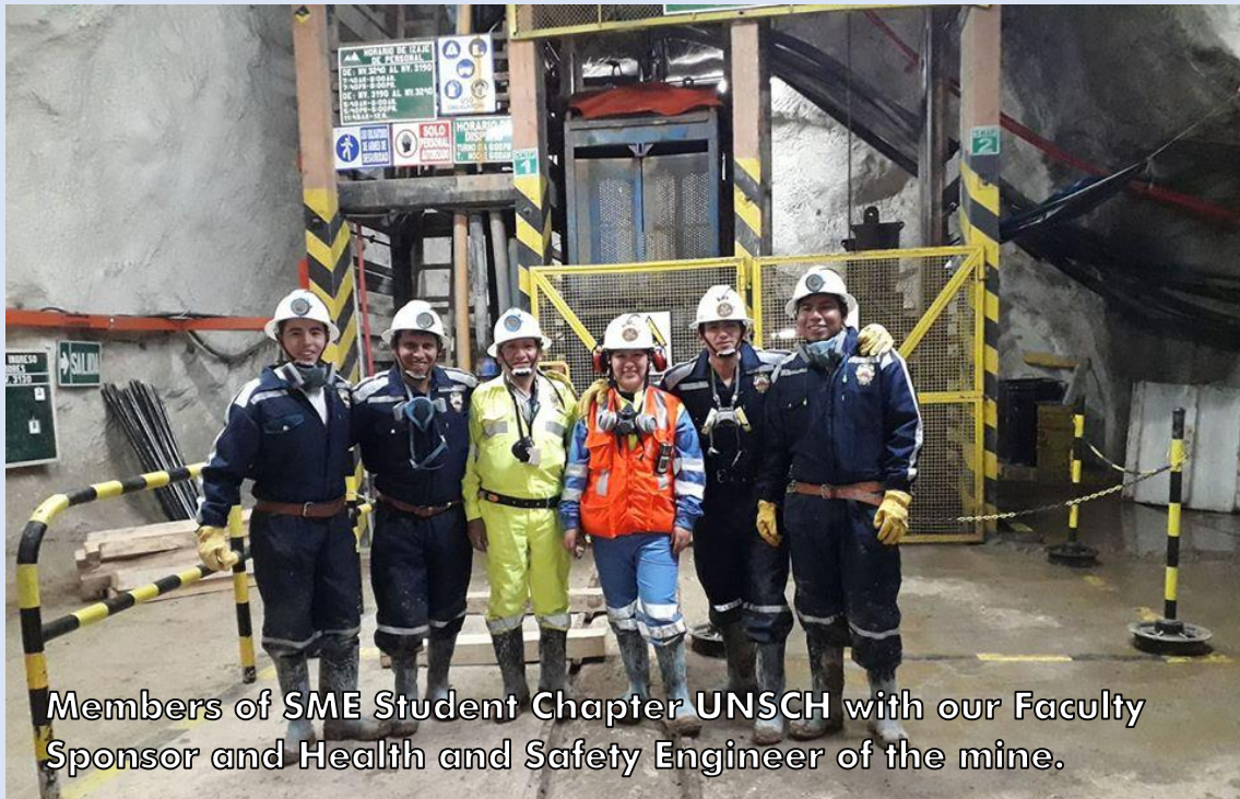
Members of SME Student Chapter UNSCH with our Faculty Sponsor and Health and Safety Engineer of the mine.